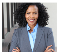
Woman of Achievement

The nomination form allows you to nominate a woman for one or all of the following categories: